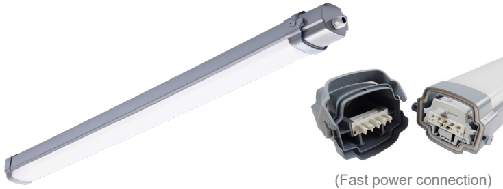
(Fast power connection)